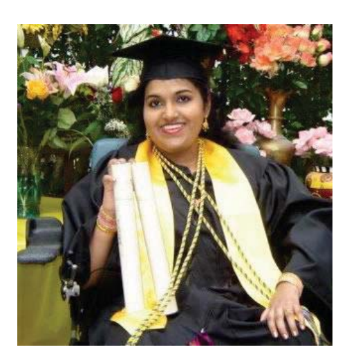
Figure 1: My Graduation Celebration

I also attribute receiving my greatest support at the University of Maryland, Baltimore County (UMBC). UMBC is a wonderful place that not only has high-quality technology research development but professors there want all students to be leaders in their field, regardless of disability. Despite my disability with spinal muscular atrophy, I completed my undergraduate at UMBC dual majoring in computer science and math in 2007. Figure 1 is the celebration of my graduation. Now, I am a PhD student working on research to increase independence for people with disabilities using robotics.