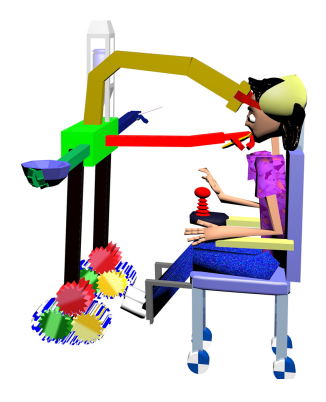
Figure 4: RoboticToothbrush brushing teeth.

RoboticToothbrush: a oral hygiene system with a head supporter and three grippers each for water supply for rinsing, a toothbrush, and a spit cup, as shown in Figure 4. Video URL: https://youtu.be/t9rYUetF2Tc.