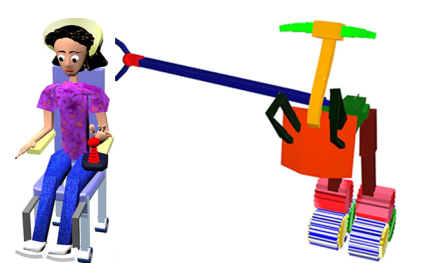
Figure 3: Motorized Commode Chair (left) and Toilet Tongs (right).

Motorized Commode Chair and Toilet Tongs are shown in Figure 3.