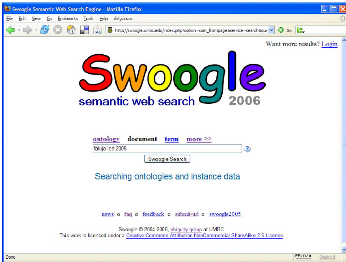
Fig. 3. This figure will be scaled to be 90% of the width of the text on the page and run across all columns in either elsart or elsart3p.