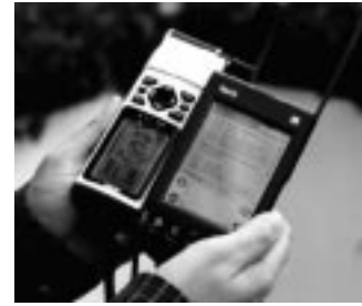
Figure 2: PDA (Palm VII) with GPS device

In the early stages of our agentized effort, we ran the agent proxies to coordinate real meeting schedules for a subgroup of five agentized people, working on five workstations and also equipped with two PDAs and one Global Positioning Service (GPS) device (providing accurate information about a user's location), as in Figure 2, over the course of two weeks. Teamcore proxies managed team-level commitments (i.e., meetings), and Friday agent proxies monitored individual users' locations and made decisions about what