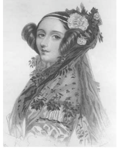
Library of Congress