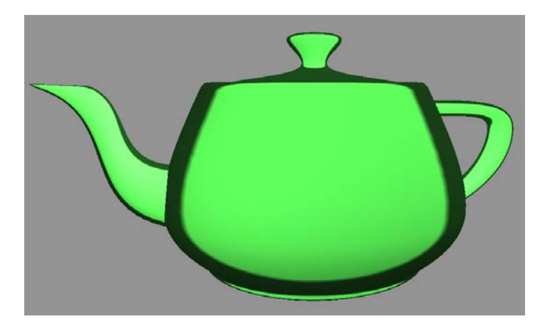
Figure 2 – NPR Metallic

Now that we've discussed the language itself and how it connects with the rest of the graphics pipeline via inputs and outputs, we will discuss an example shader called NPR Metallic. We call it this since it was designed to look like a metallic surface which would exist in a world rendered in a cel-animation style (Figure 2).