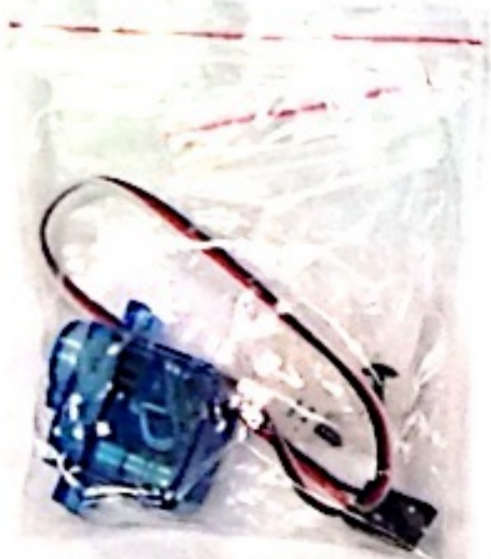
9. Servo Package Includes - Servo Motor (1 No.) Screws (2 No.s) & 3 Additional Fixtures