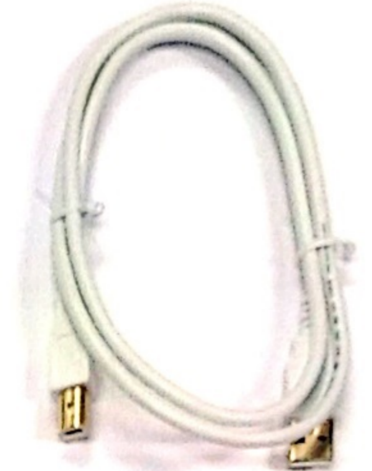
8. USB Cable (1 No.)