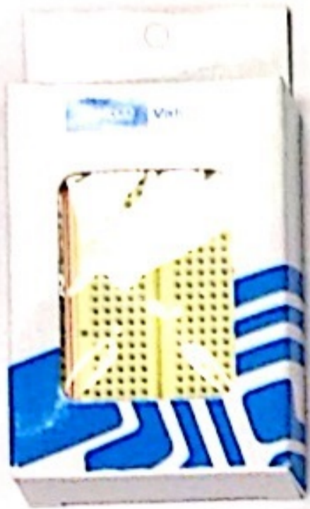
6. Breadboard (1 No.)