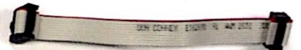
11. JTAG Cable (1 No.s)