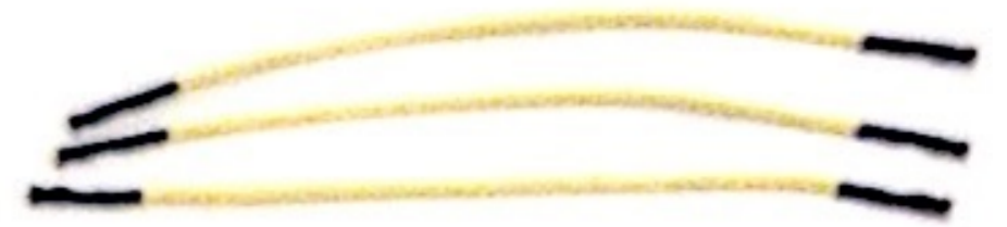
5. Jumpers (3 No.s)