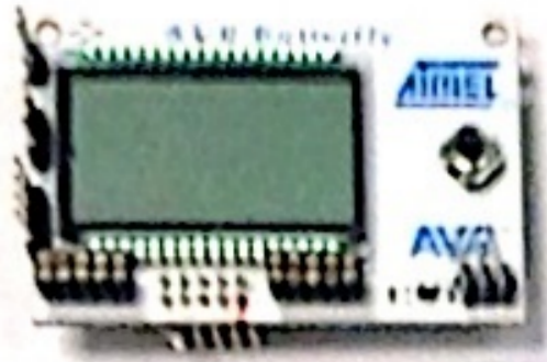
1. AVR Butterfly Board (1 No.s)