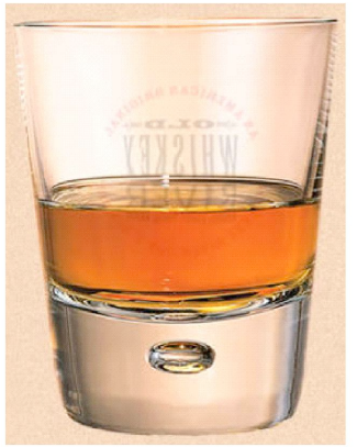
loses its beneficial effects when taken in large quantities